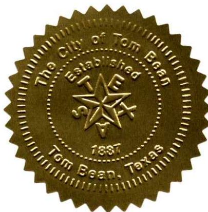
Date of Adoption