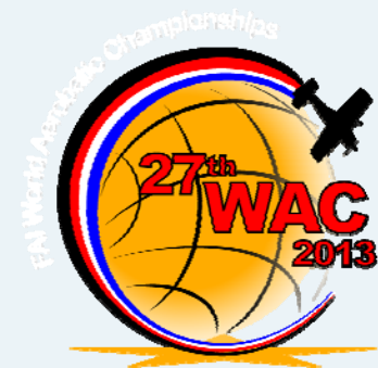
North Texas Regional Airport (RGY) - USA

Events such as the ones listed above add benefit to the local economy and gives our area national exposure which helps attract economic development and tourism to our area.