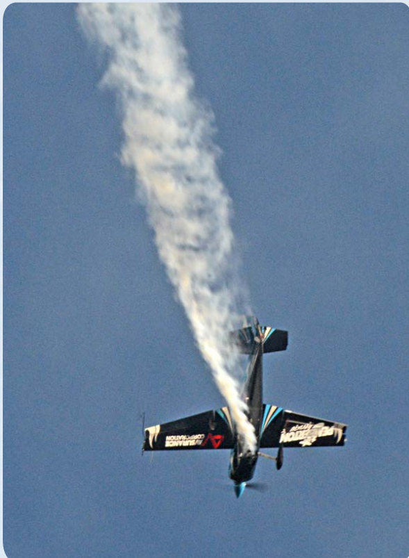
A plane performs an aerial maneuver during the World Aerobatics Championship held at North Texas Regional Airport.

The contest takes place every two years and the next time will be in Slovakia. ♦