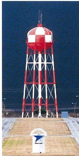
The water tower at the North Texas Regional Airport.