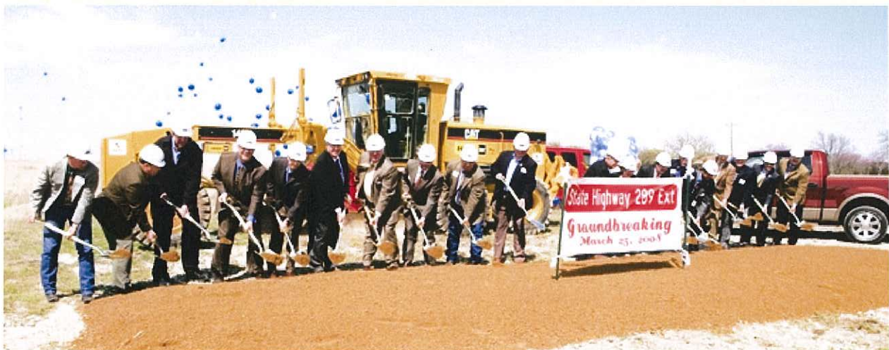
The groundbreaking event for the commencement of the extension of SH289!