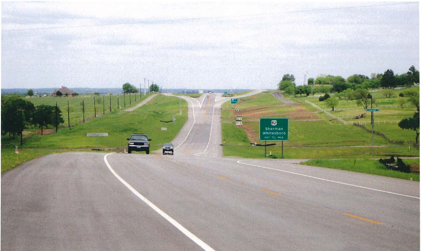
The extension of SH289 to Pottsboro has helped provide infrastructure for additional economic growth in Grayson County. 3